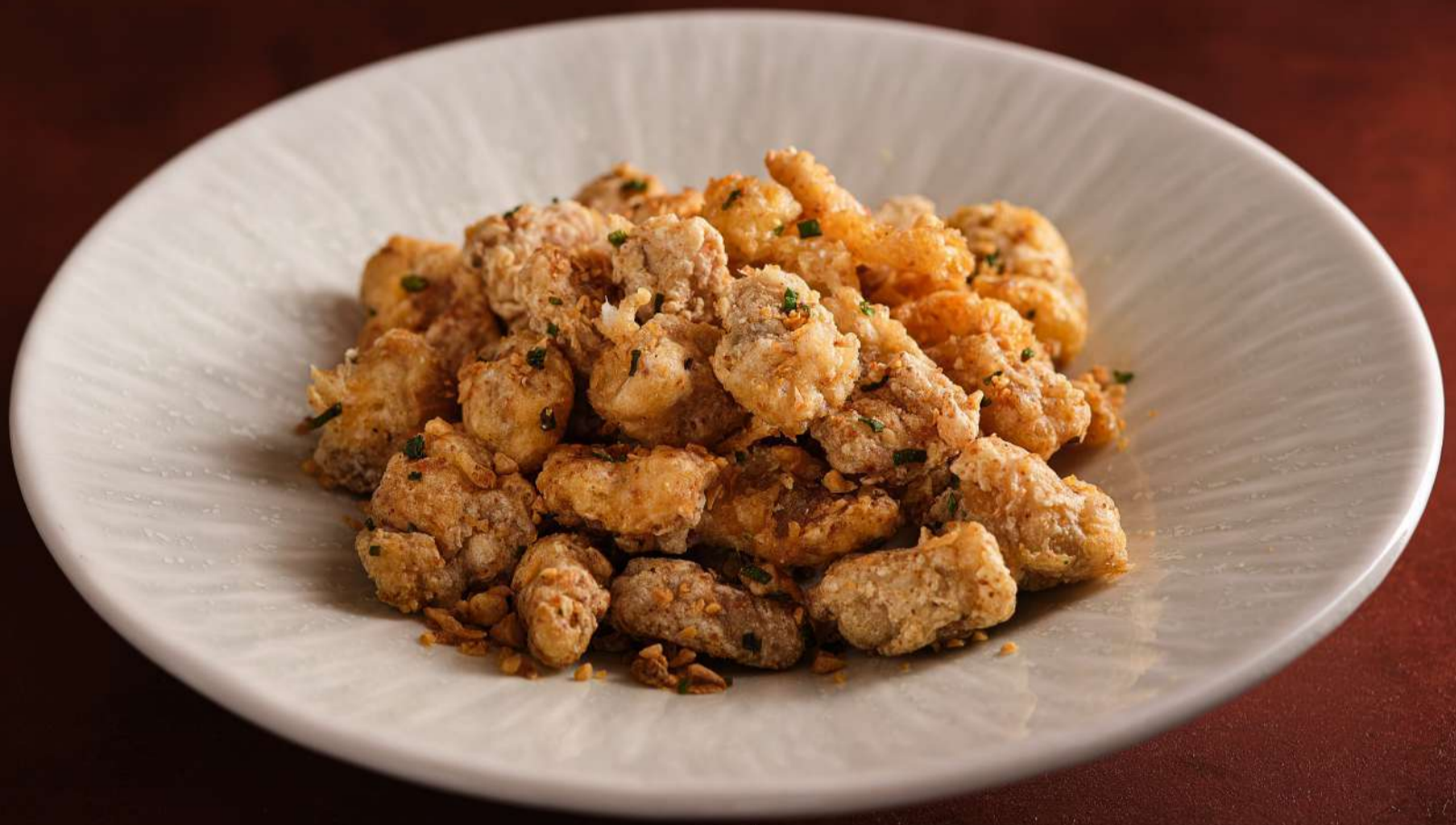
chicken cartilage fried with garlic _____ 178