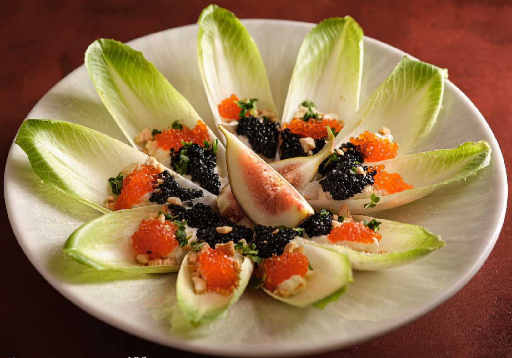
caviar lettuce _____ 198